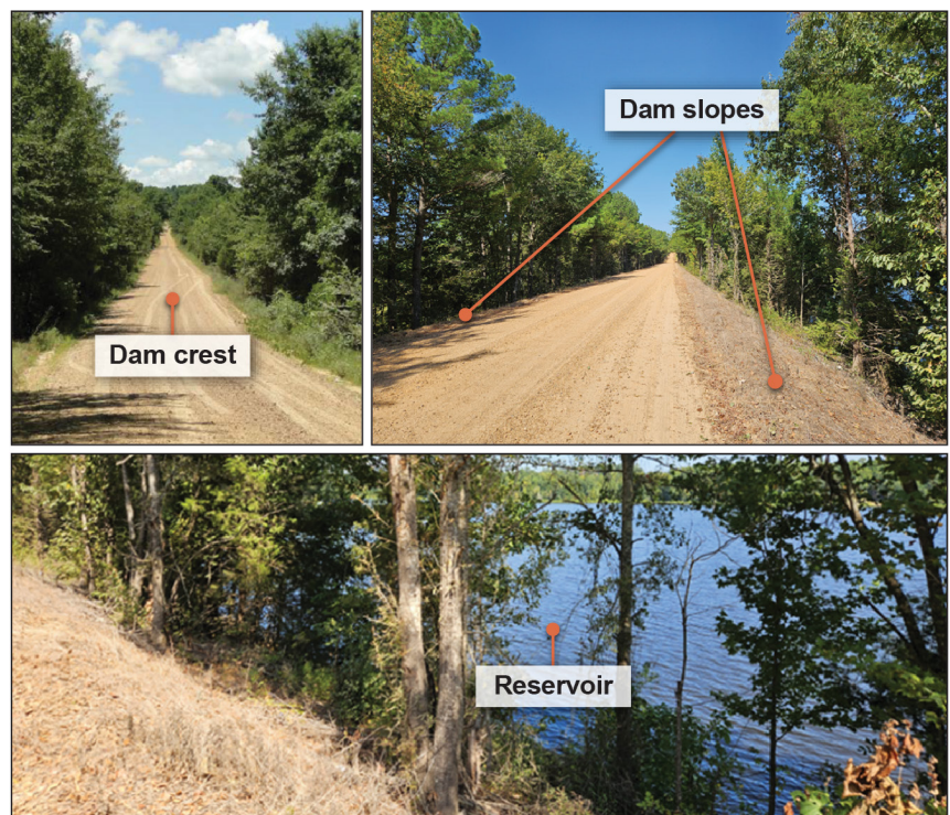
Figure 4: Embankment of Natural Resources Conservation Service Watershed Dam with Heavy Vegetation, Mississippi, 2017 (top left) and 2024 (top right and bottom)

GAO-25-107404