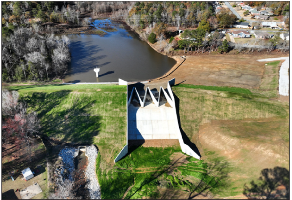
Figure 3: Example of a Rehabilitated Natural Resources Conservation Service (NRCS) Watershed Dam

GAO-25-107404